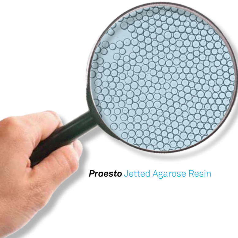
Praesto Jetted Agarose Resin